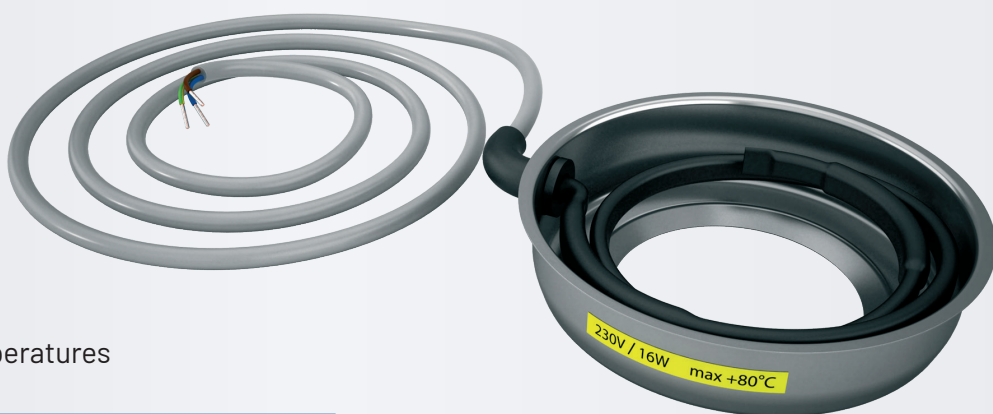
Rated power W/m at different temperatures